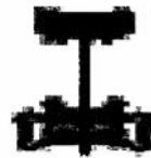
HÅG Capisco 8105