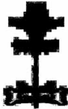
HÅG Capisco 8106