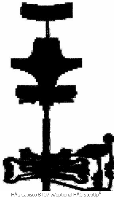
HÅG Capisco 8107 w/optional HÅG StepUp®