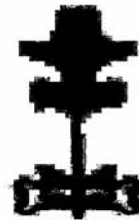
HÅG Capisco 8126